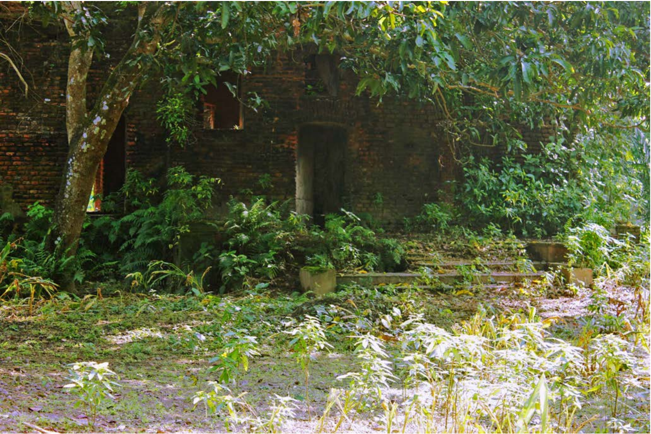
Front side / Entry Ruins of the old House of Kalikananda Chattopadhyay