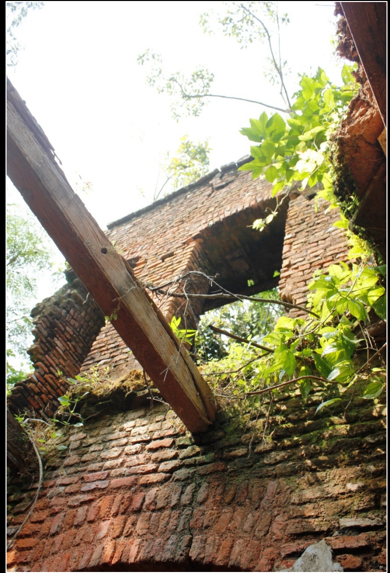
Huge Structure with beautiful high windows standing from the floor.