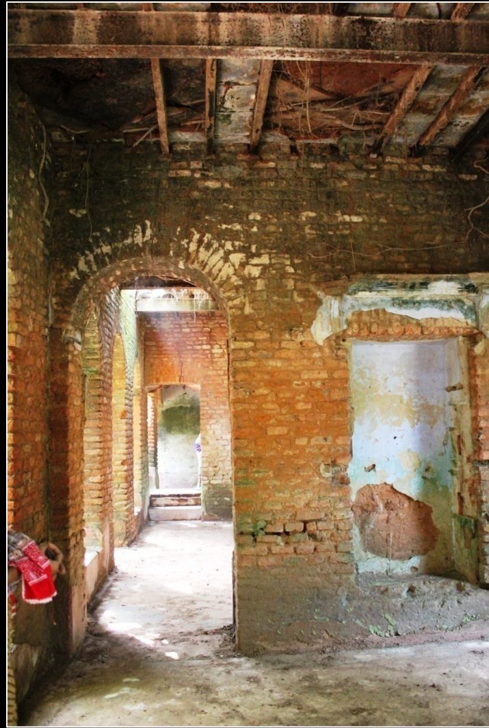
The falling roof and the room with belcony.