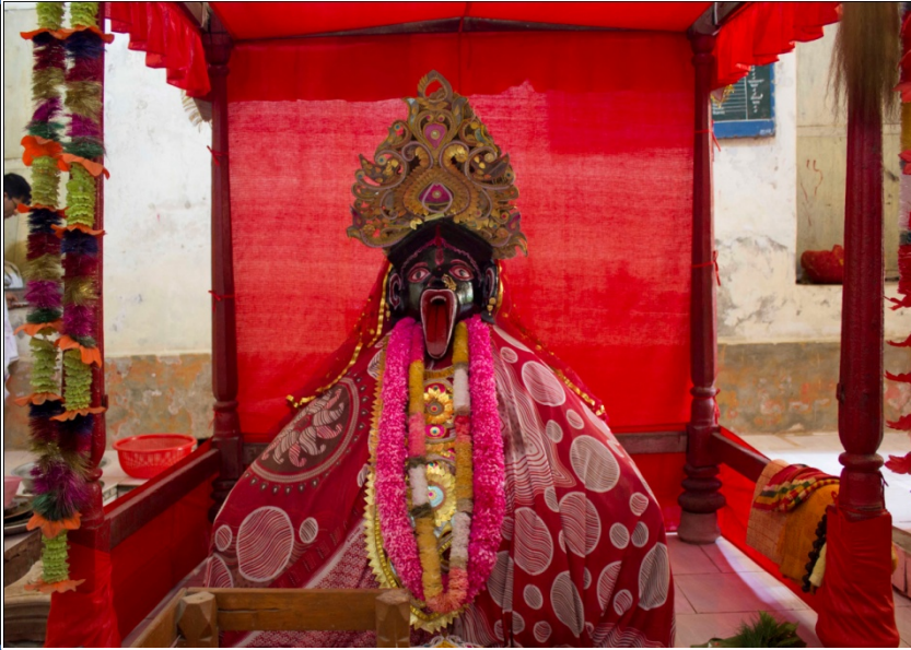
Lord Kali temple at Jeshoreshwari,