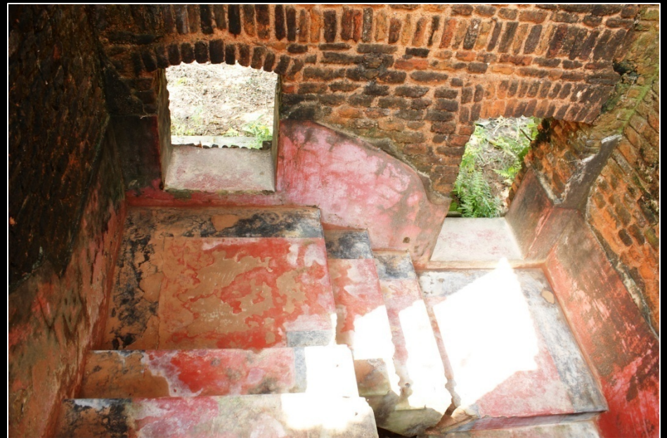
The Room under the staircase inside the house. Red smooth cemented floor with coiled stairs which ended on the upper floor facing four rooms and four doors which lead to the veranda.