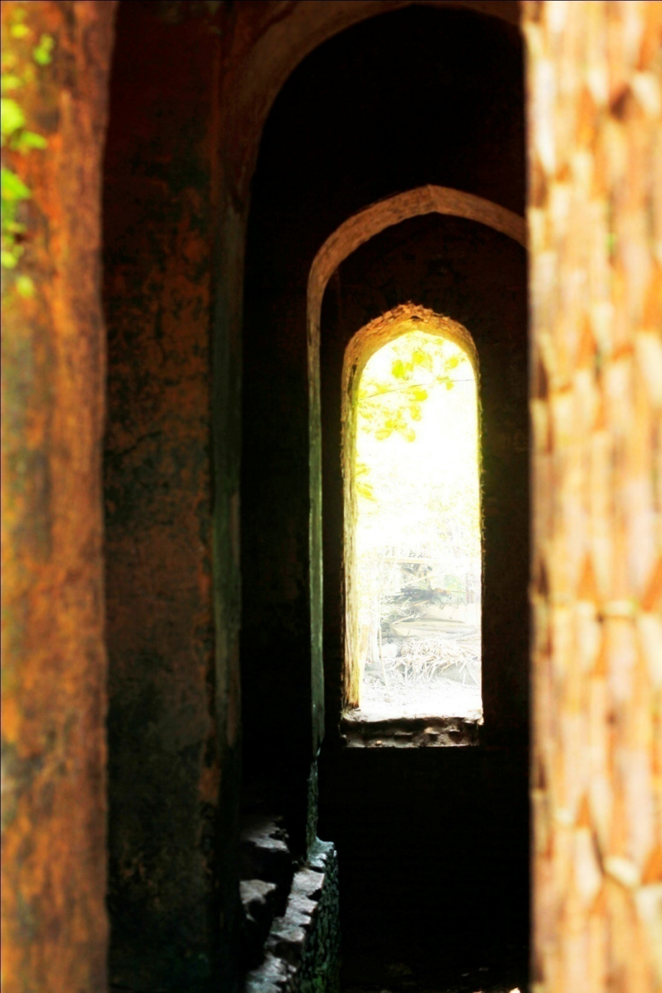
A twelve gated hammam (Bathing room), of Raja Pratapadityay;