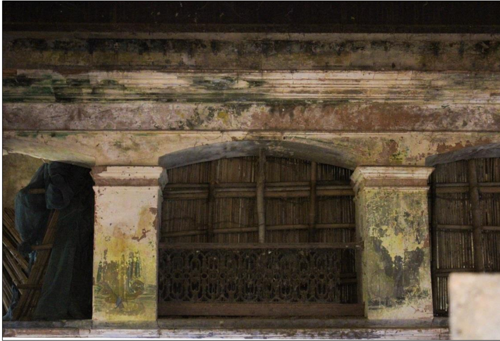
Pic: Gallery Balcony