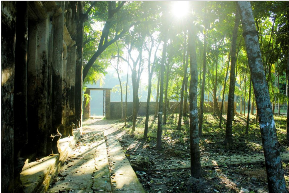
Pic: Gourarang Palace area