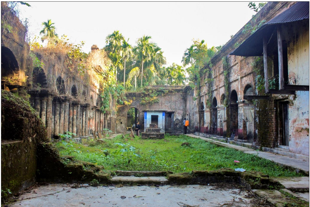
Pic: Gourarang Palace (Front)