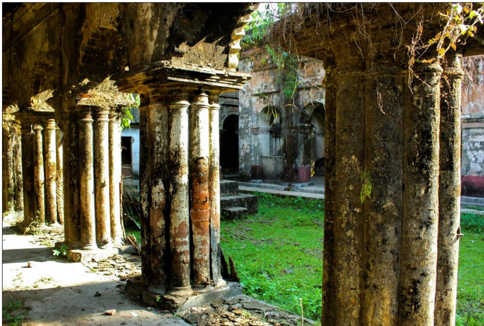
Pic: From the corridors.