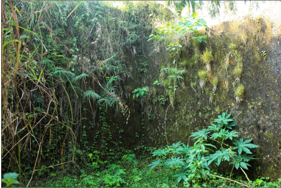
Pic: old rooms