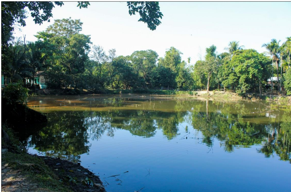
Pic: Gourarang Palace surrounding