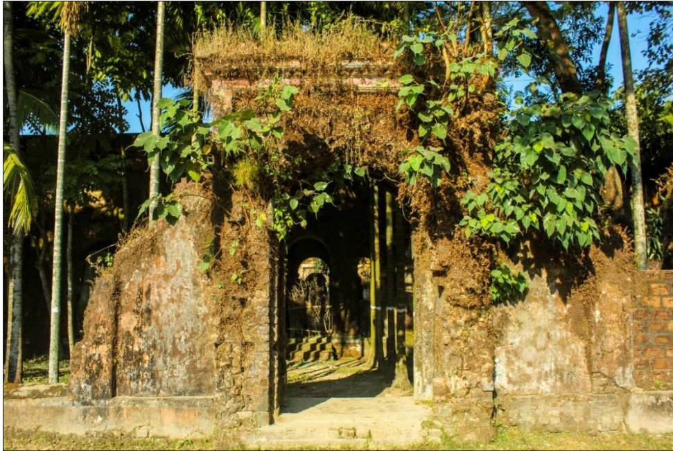
Pic: Grand entrance door

388/D Free School Street, Hatirpool, Dhanmondi, Dhaka-1205. Ph: +88 01726831636, Email: urontoinfo@gmail.com