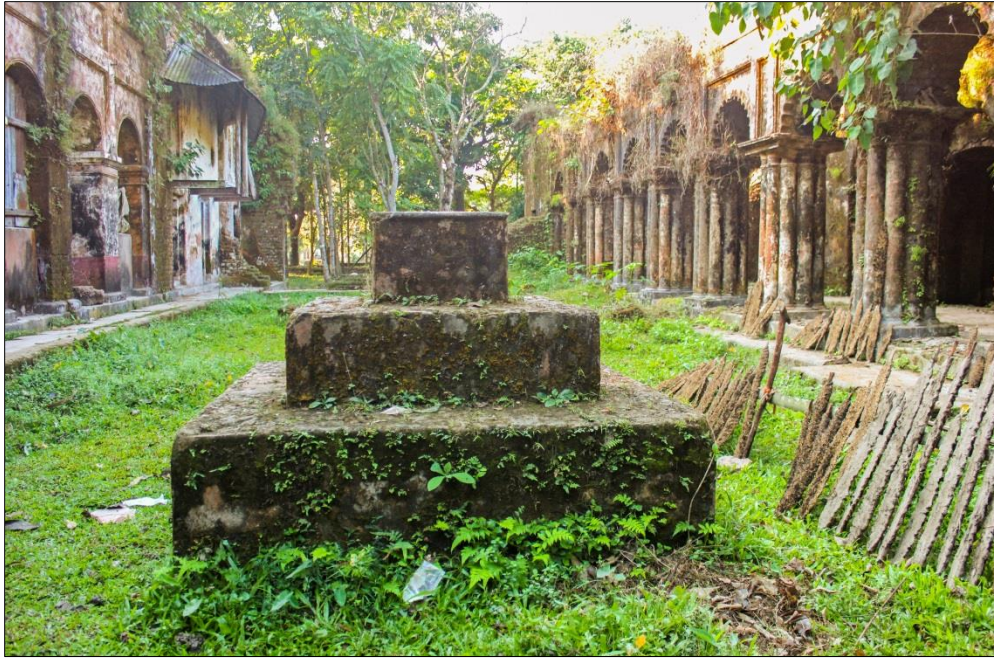
Pic: Gourarang Palace