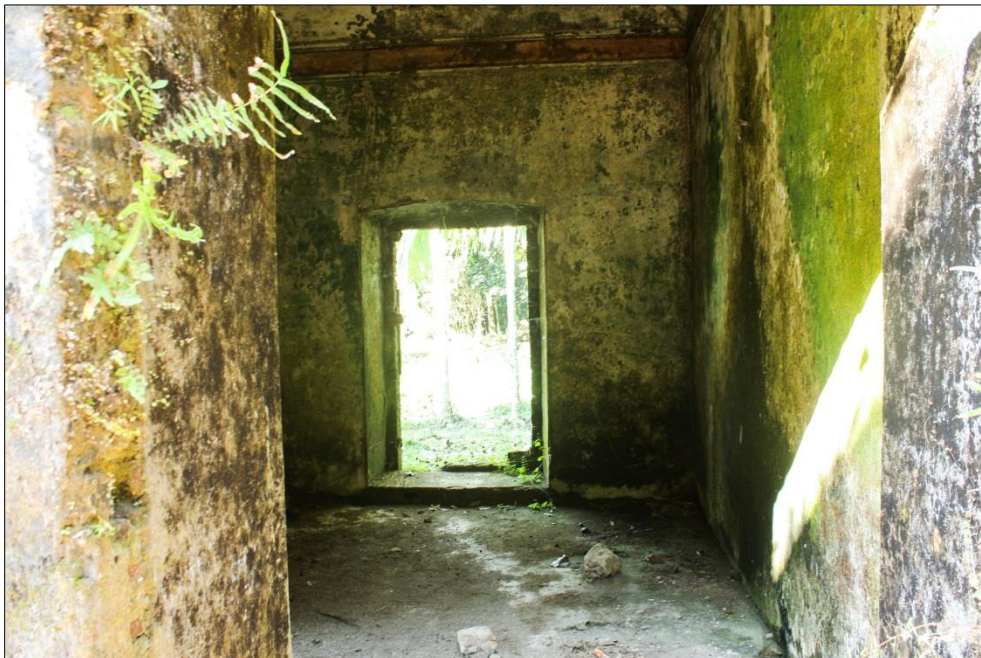
Pic: old rooms