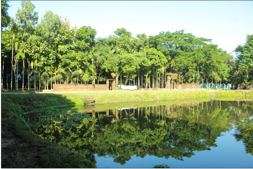
Pic: Gourarang Palace area