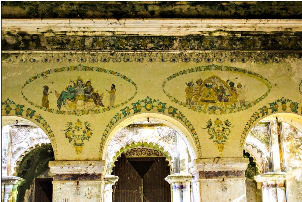
Pic: Nachmahal (Performance Hall) and its decorations last few existence.