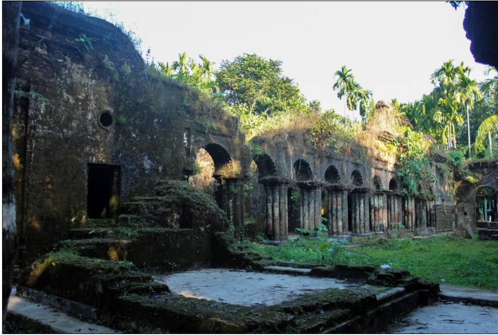
Pic: Gourarang Palace Entrance (left)