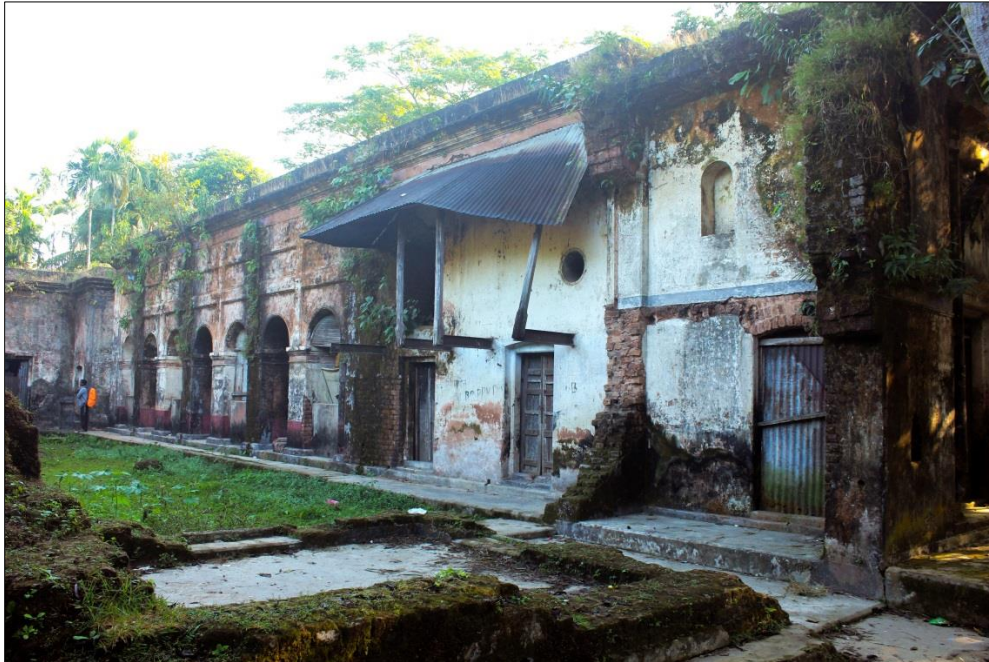
Pic: Gourarang Palace Entrance (right)