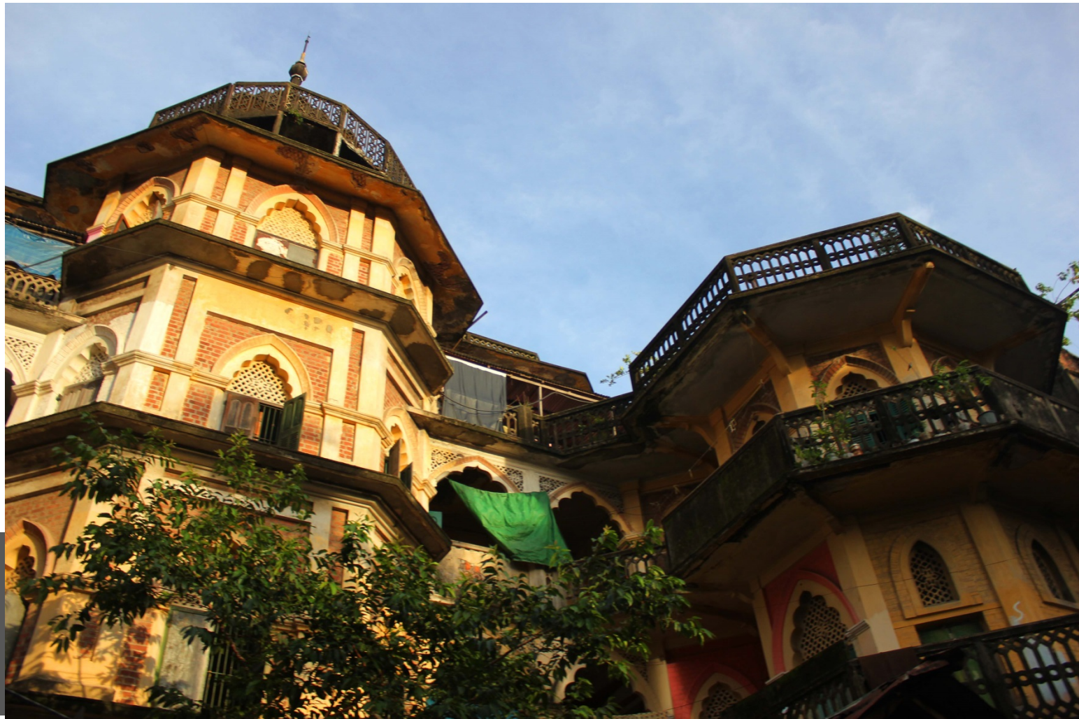
Right Side View of The Building