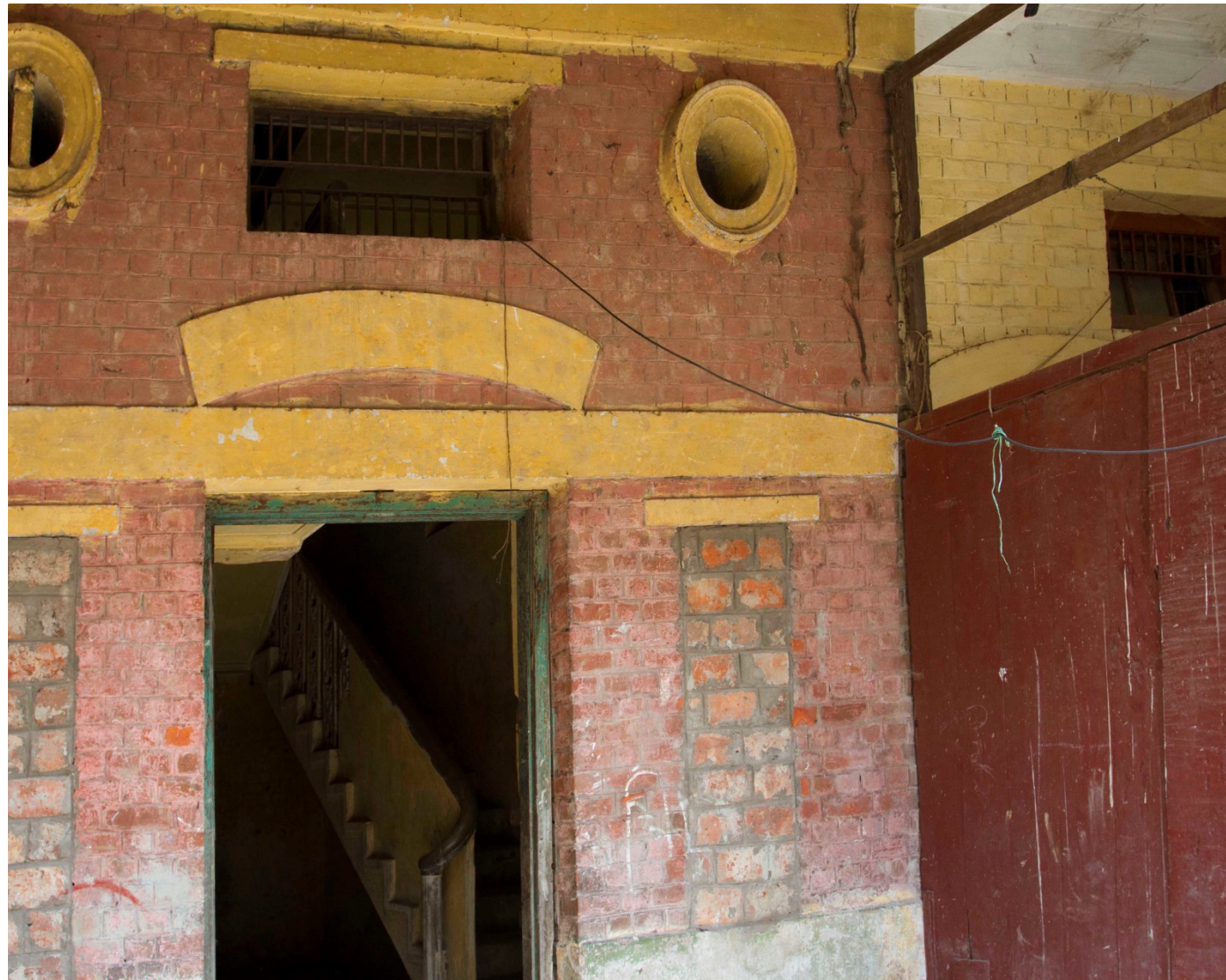
Entrance of the Building