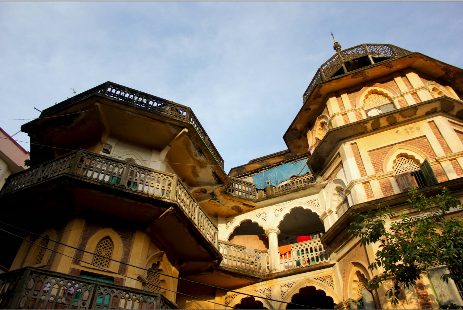
Left side View of The Building