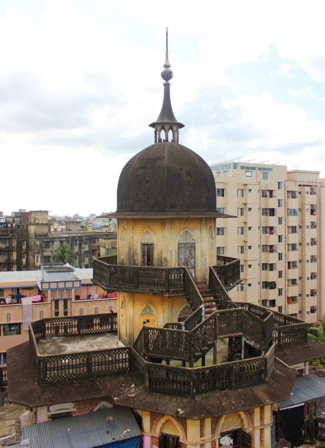
The Minar On Top