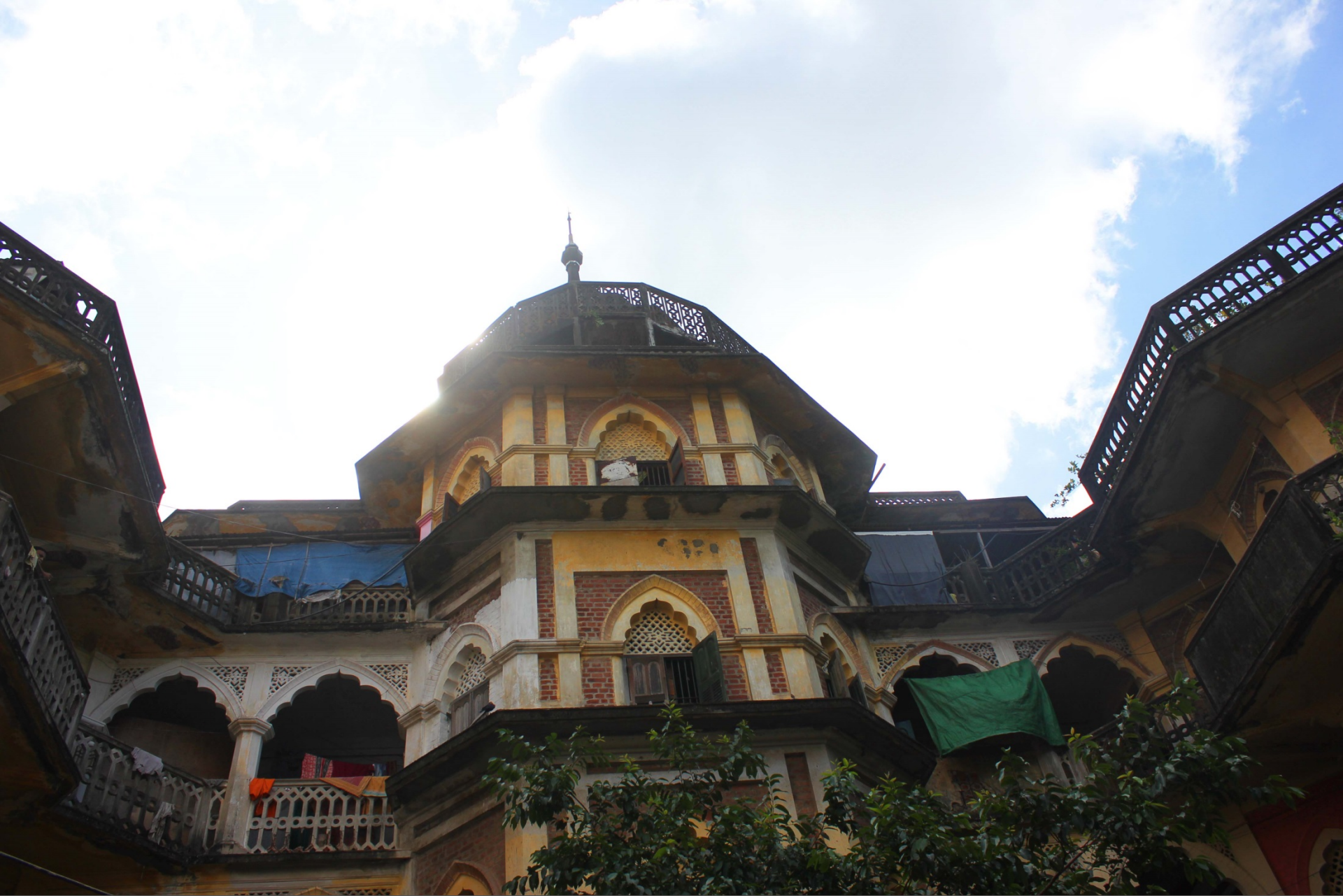
P K Sen Building : Front Look