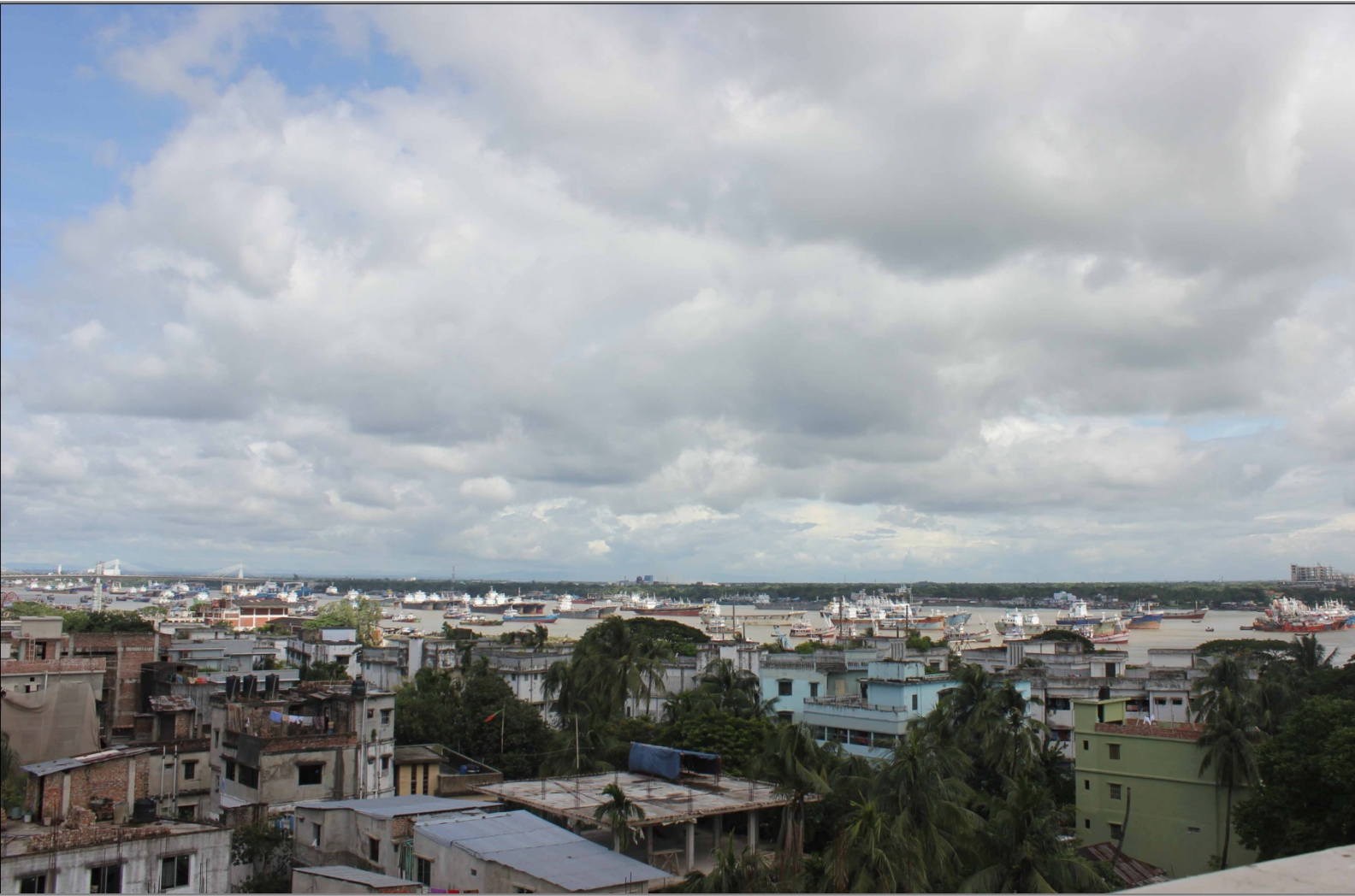
The view from the roof