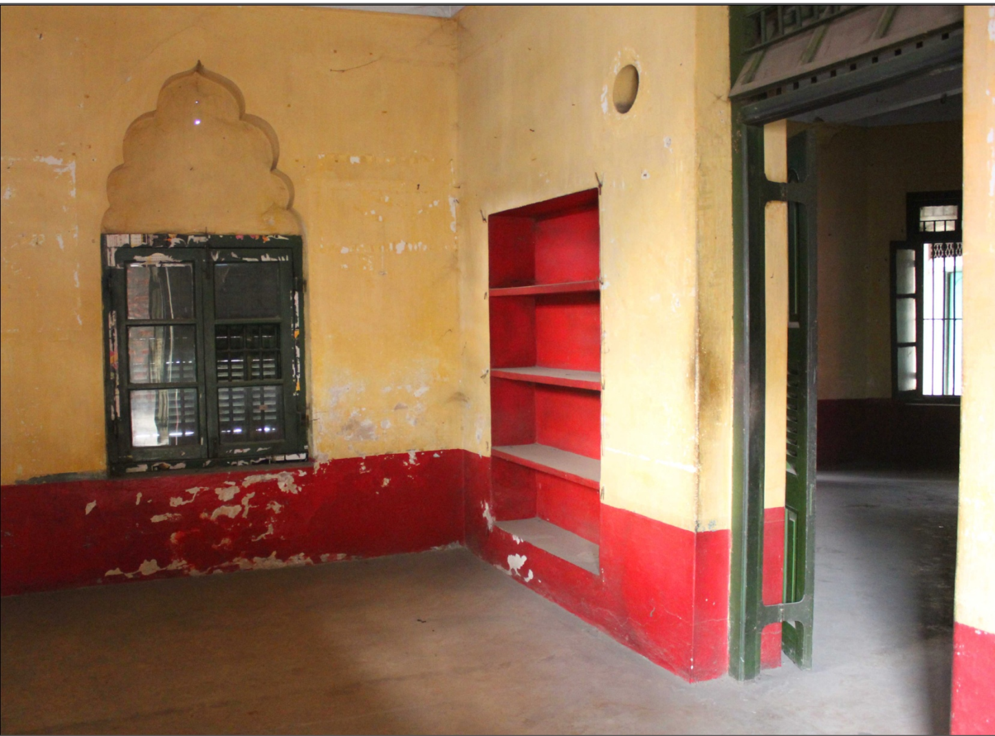
Rooms of the building