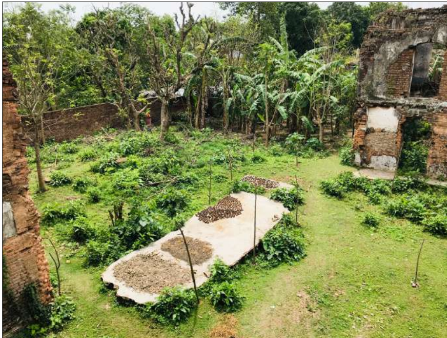
Image: The fallen part of the hanging balcony (used by local to dry things)