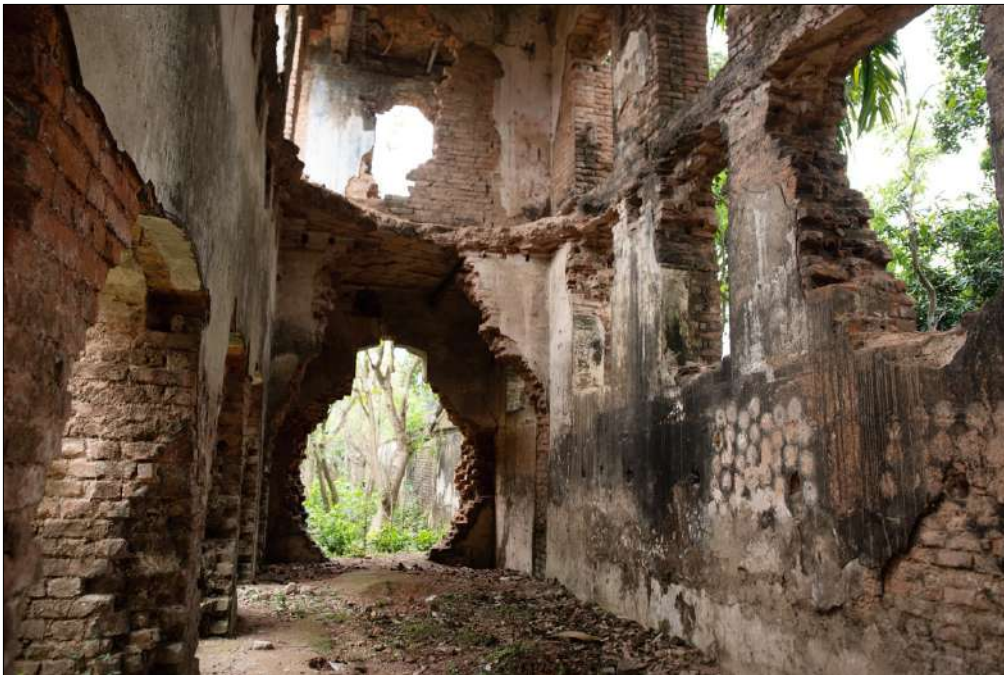
PC: Shams Xaman